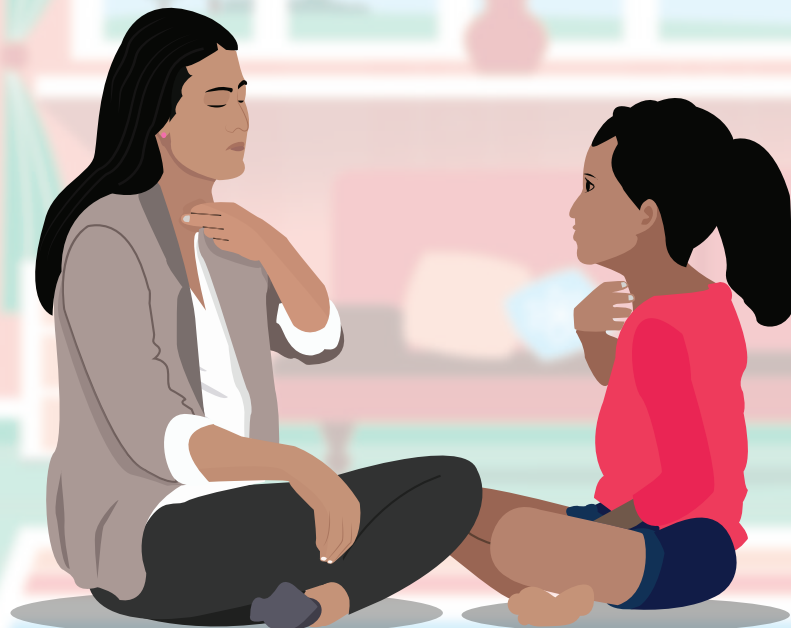
Illustration by Amit nanda

Take your practice to the next level with the best assessments in the area 'Speech and language'